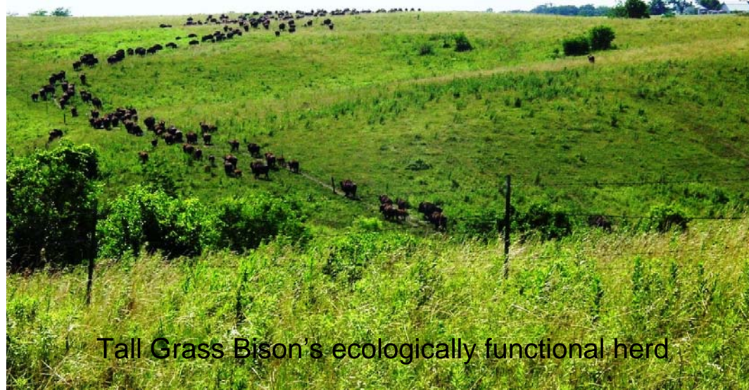
Tall Grass Bison's ecologically functional herd

To restore, preserve, or maintain prairies, grazers (cattle or buffalo) with evolution's ancestral knowledge is necessary.